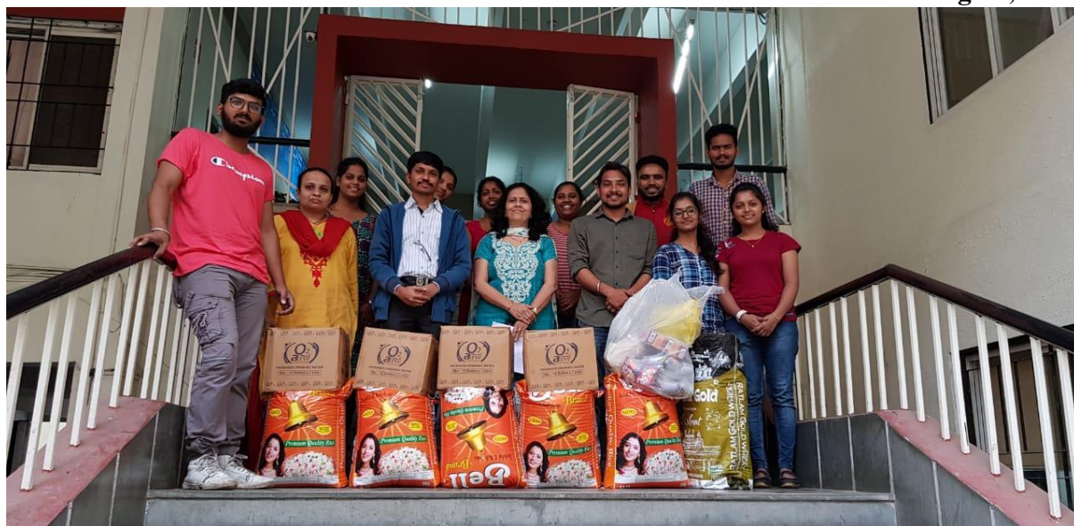
Collection of Necessities and Funds at College for distribution