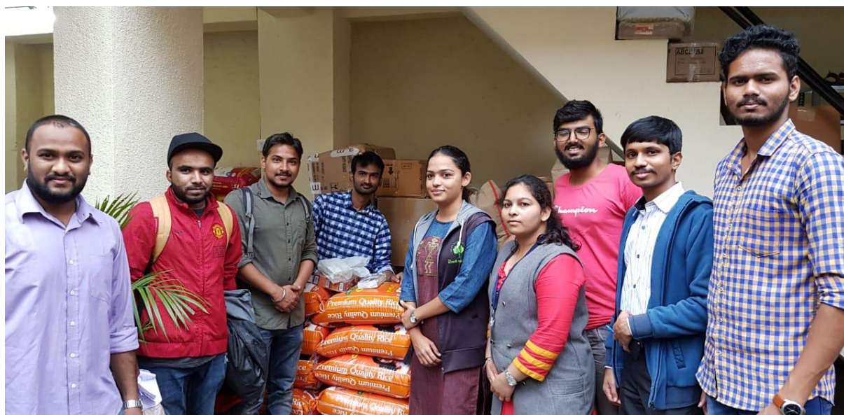
Submitted Necessities and Funds for distribution