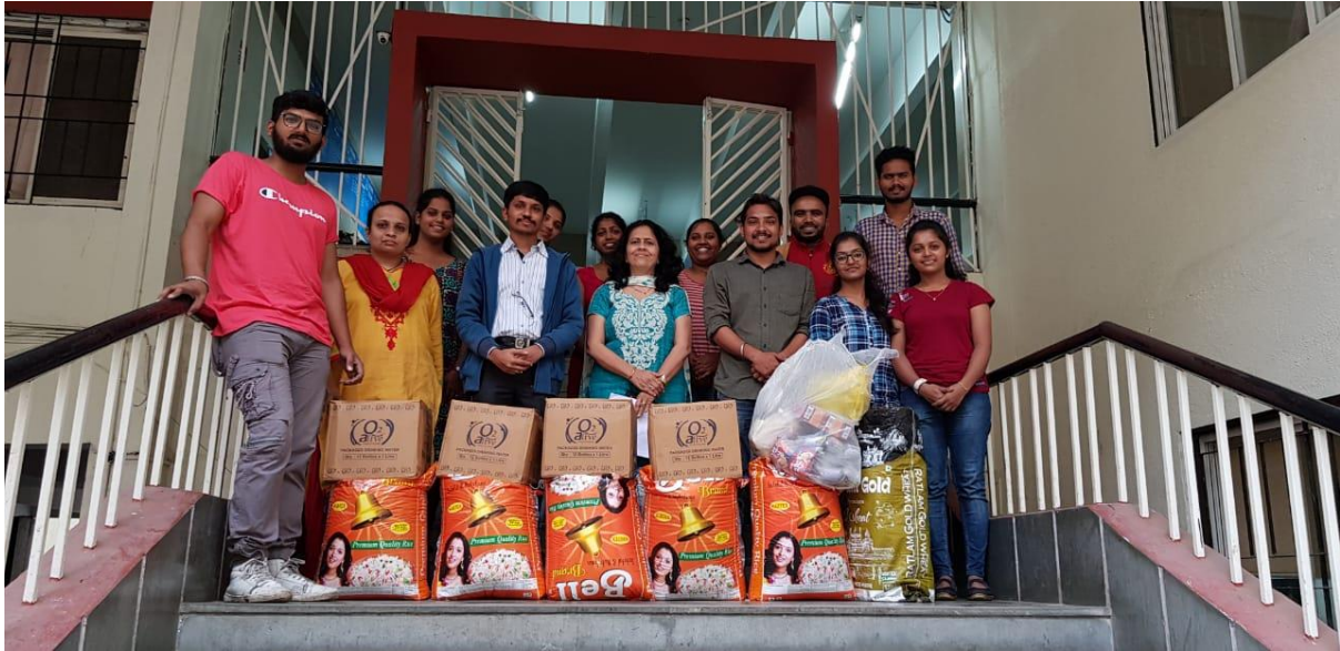
Collection of Necessities and Funds at College for distribution