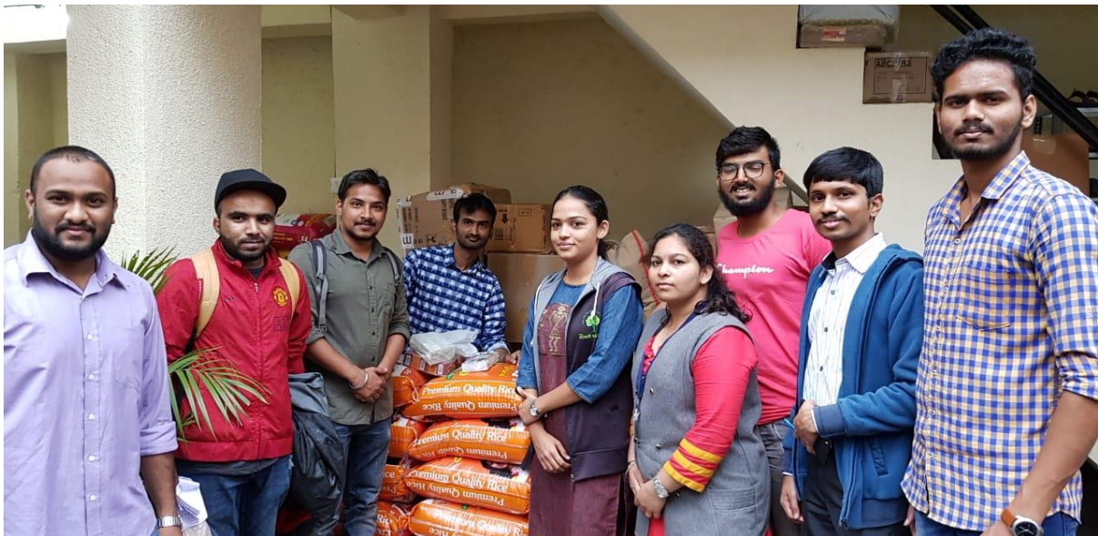
Submitted Necessities and Funds for distribution